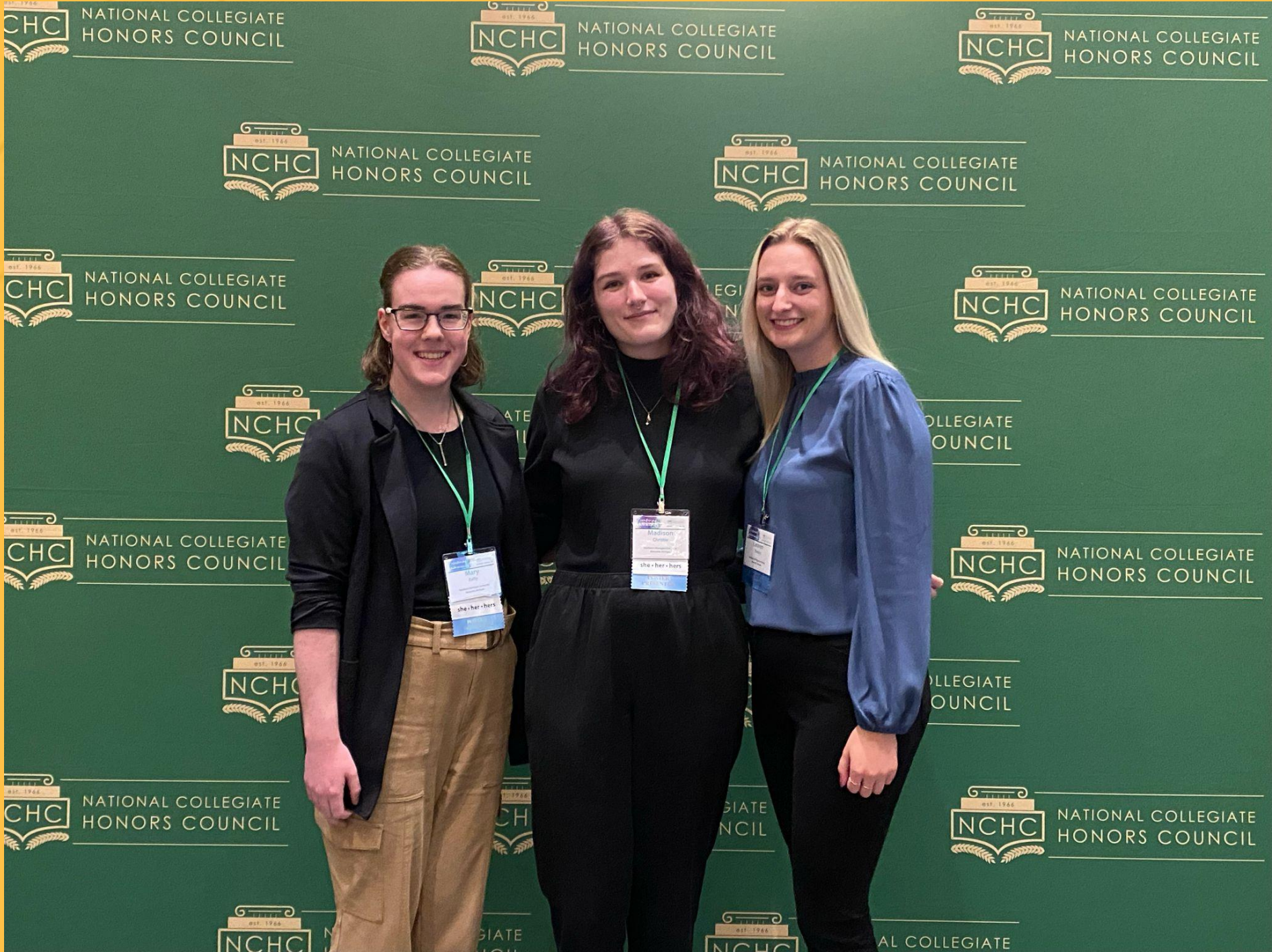
National Collegiate Honors Council Conference