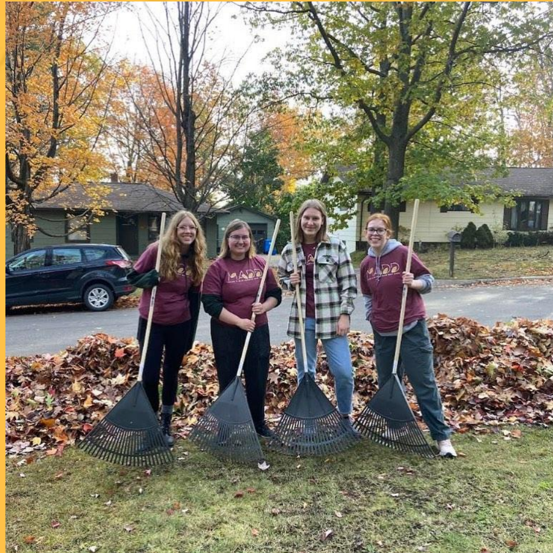
Honors Student Organization (HSO)