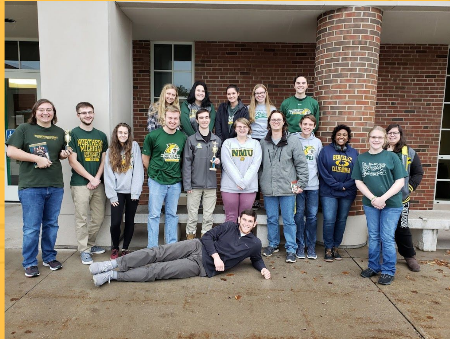
NMU Quiz Bowl Team