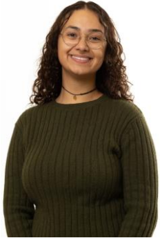
Director of Public Relations