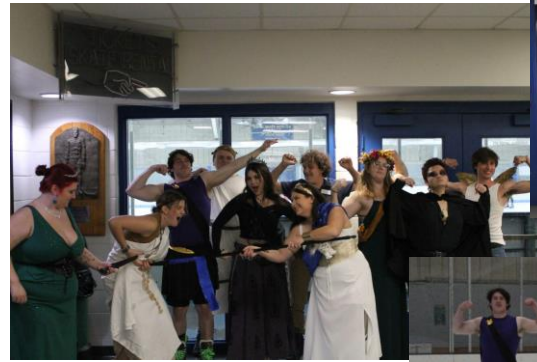
Costume contest open skate