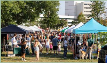
Wildcat Farmers Market