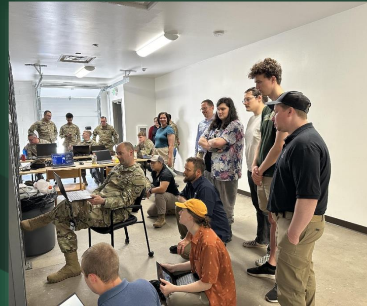
NMU IA/CD STUDENTS BEING READ IN ON MISSION