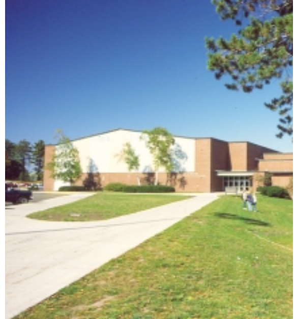
Construction on the east campus renovation projects, which include converting Hedgcock Fieldhouse into a students services building and a recital hall, is scheduled to begin this summer, with estimated completion in July 2004.

"The art and design addition is necessary to accommodate those components currently housed in