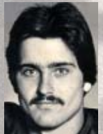
Steve Mariucci (1977)