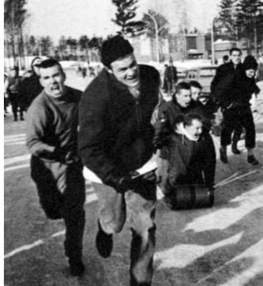
Winter Festival, 1963.