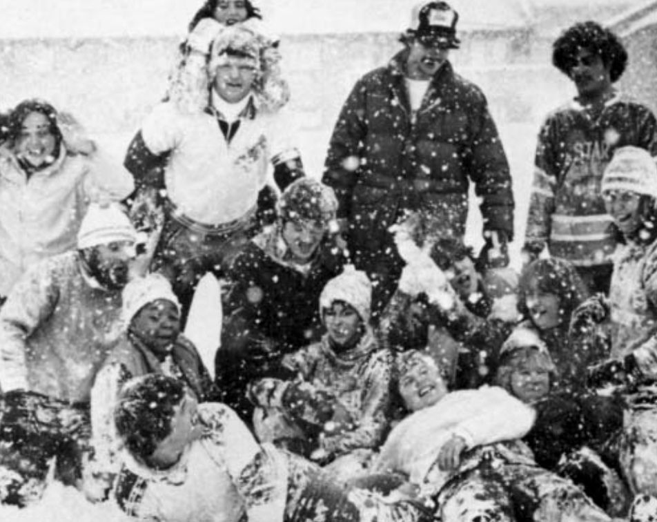
Winter 1980.