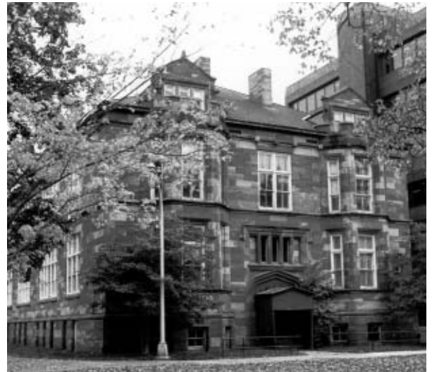
Longyear Hall, circa 1979.

The early dormitory for girls was a long, white, wooden building situated on a grassy plot on the south side of College Avenue—most convenient to the school. After it no longer served as a dormitory, it became the original St. Michael Church, the one in which I was married. It has long