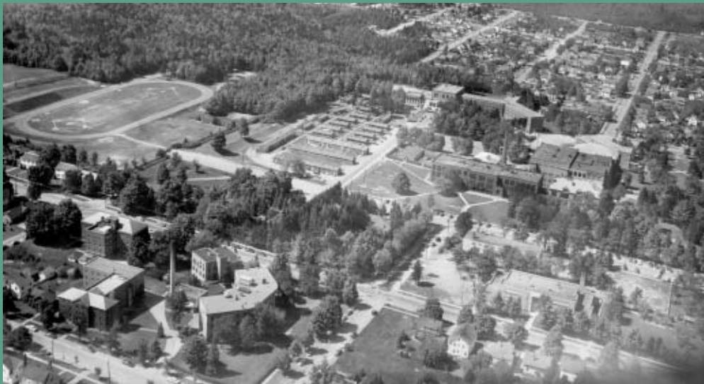
◀ Aerial view of Northern Michigan University, 1953.

sor at the University of Michigan in Flint. mtippen@umflint.edu