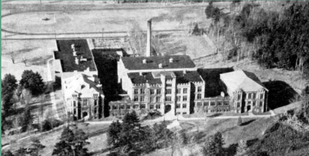
◀ Elevated view of Northern State Teacher's College, 1930s.