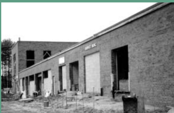
◀ NMU begins renovating the old Services Building and power plant to become the new Art and Design Studios North. The project was completed in the fall of 1996.