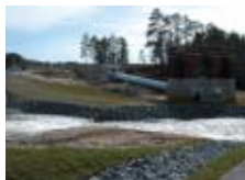
Remnants of the Tourist Park Dam.