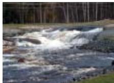
The newly created Tourist Park Falls.

More photos and information on the initiative for a free-flowing Dead River can be found online at spaces.msn.com/members/freeflowingdeadriver.com .