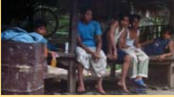
Shelters such as this are all some Indonesian families have to protect themselves from the elements.

line export business that he hopes will become the largest in the world. Savola is also participating in the venture.