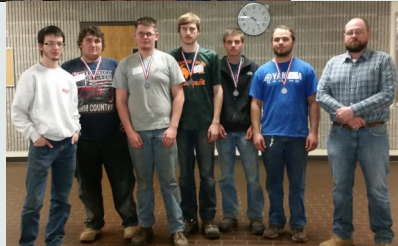
Runner Up Westwood