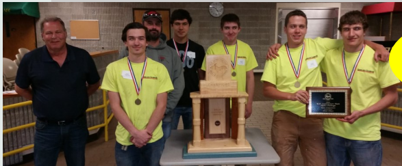
Champions Dickinson Iron ISD