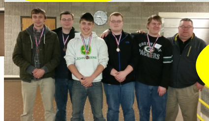
Third Place Munising