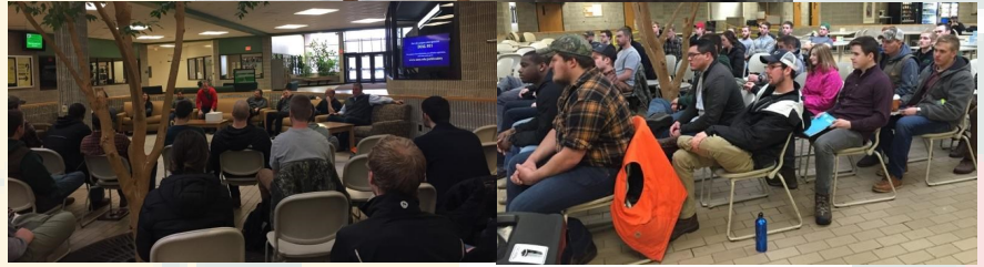
The 2016 Student Summit was held on 18 March