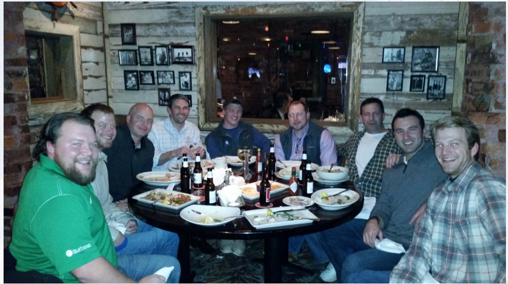
Good food & good friends getting together

The evening was filled with a lot of laughter and an incredible amount of camaraderie. The NMU presence is strong in the Lone Star state. Also noteworthy is that the day before this dinner, Texas had a snow day—ice and snow ripped through the southwest. Nothing stops NMU Construction Managers!