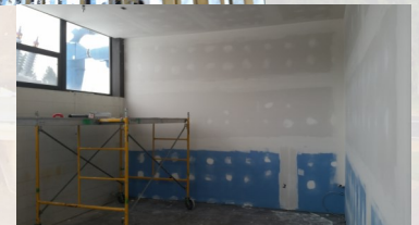
Progress photos for the N.E. corner of the Jacobetti High Bay lab