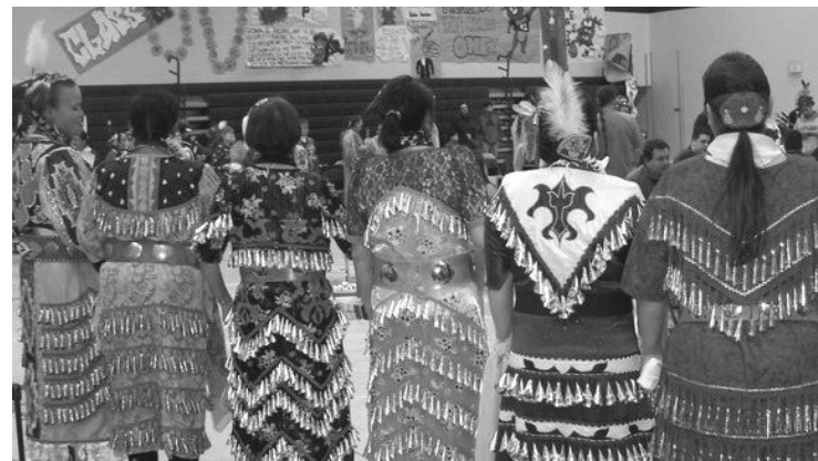
Photo left: Jingle dress dancers in line at the recent Lac Vieux Desert mid-winter powwow on February 19.

These listings are collected from various sources. Always double check with the powwow committee about specific information.