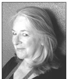
featuring author Linda Hogan

Sponsored by the NMU Center for Native American Studies with the generous support of the Keweenaw Bay Indian Community, NMU Multicultural Educational Resource Center, NMU Geography Department, NMU College of Arts and Sciences, and NMU English Department